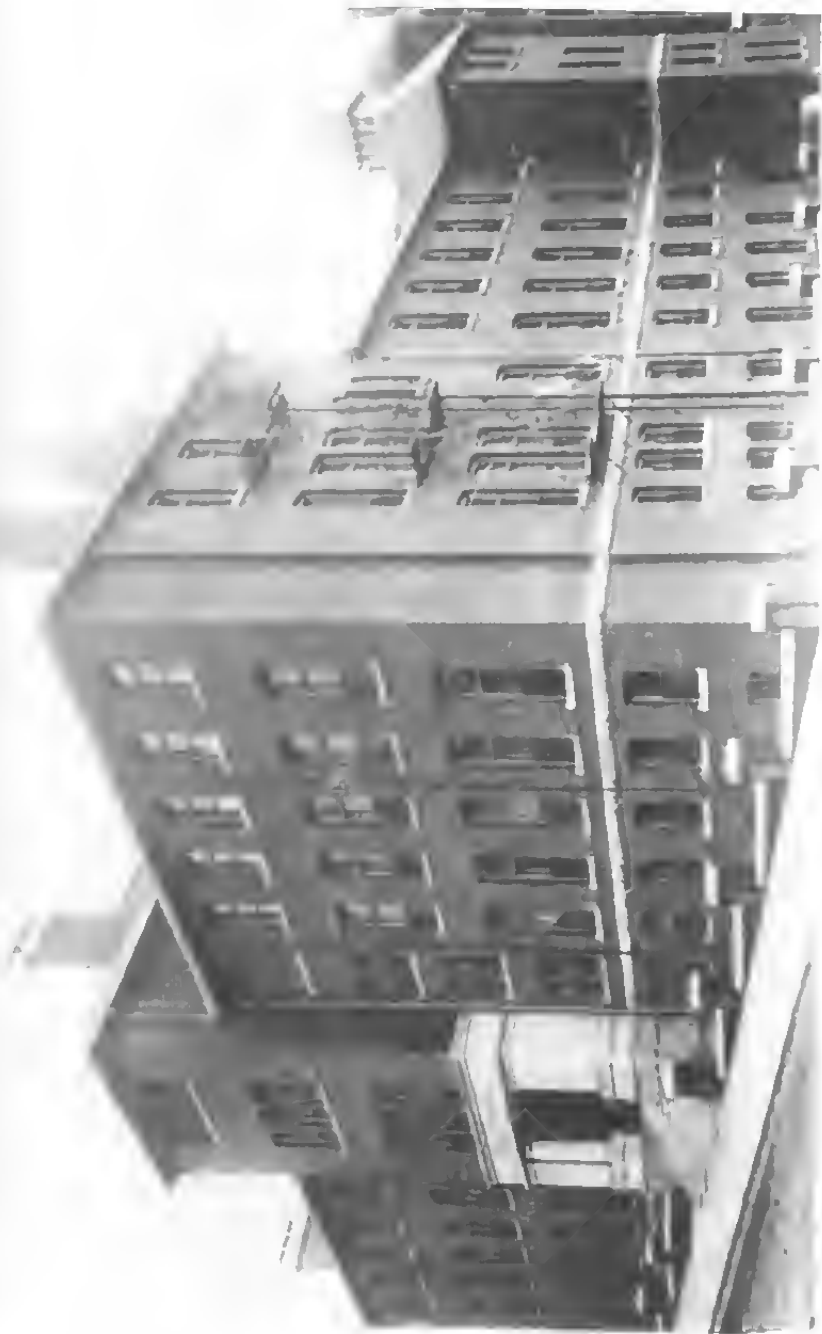
Lane Hospital, 1895